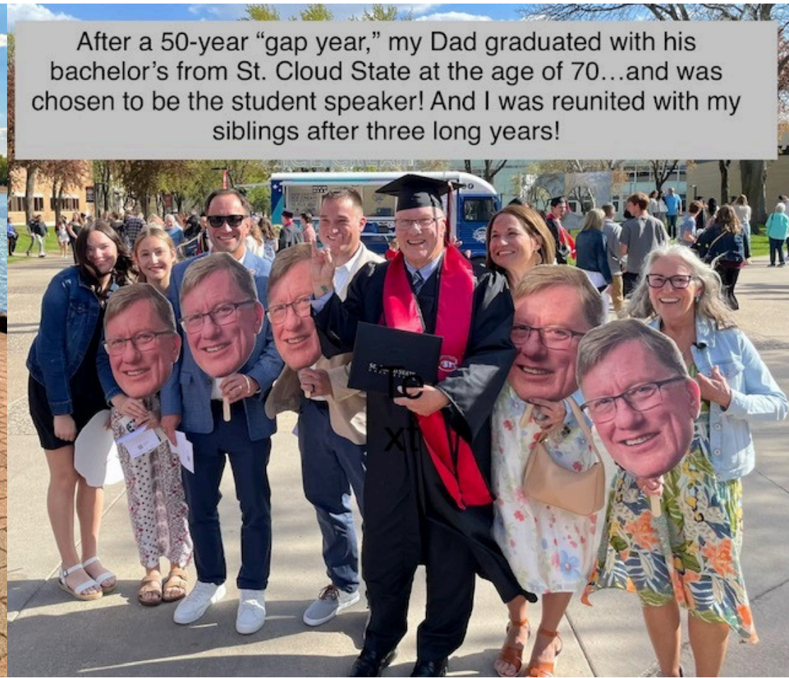
After a 50-year "gap year," my Dad graduated with his bachelor's from St. Cloud State at the age of 70...and was chosen to be the student speaker! And I was reunited with my siblings after three long years!