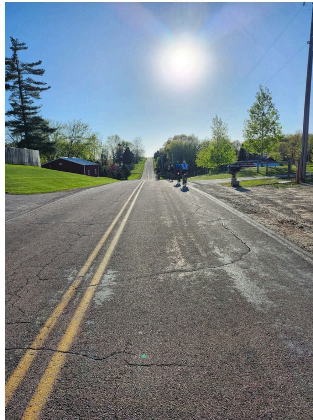
Biking with friends - Suzie Howe