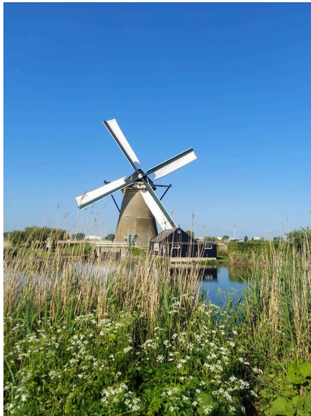
My first European vacation - Erin Nelson!