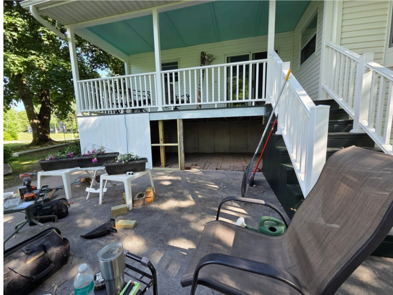
Home improvement projects are my jam! - Rich Petro