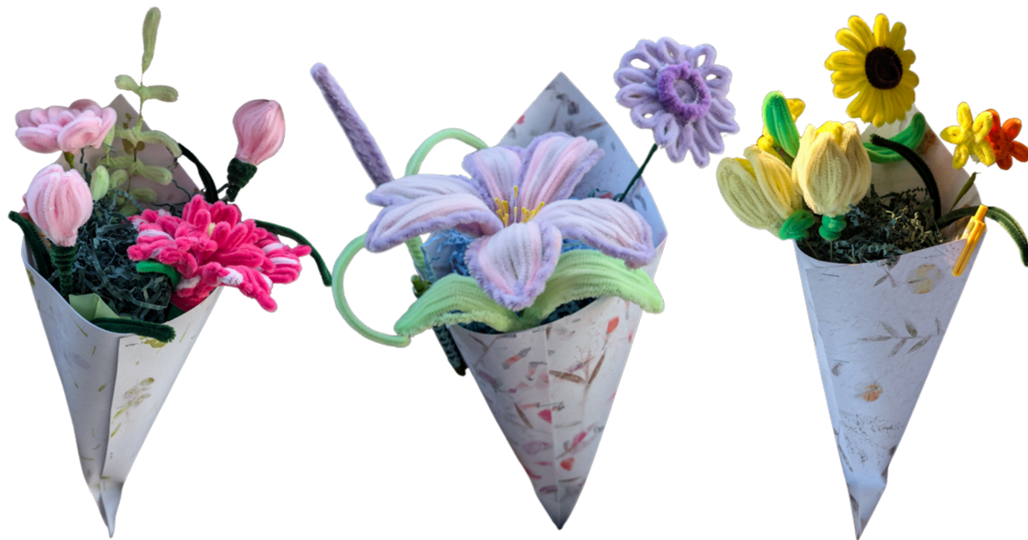
Made May Day flower baskets for some friends and family - Sydney